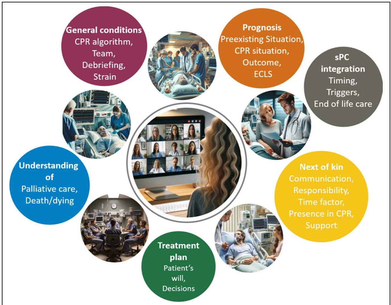
Figure 2. Qualitative focus group study setting ( encircled ), surrounded by the results (main categories, bold , with their respective subcategories) addressing the patient, their next of kin, the intensive/emergency care teams, and the specialist palliative care (sPC) team in cardiopulmonary resuscitation (CPR) situations. The authors used Generative Pretrained Transformer 4, OpenAI's large-scale, multimodal model to create the illustrative images. ECLS = extracorporeal life support.

neurologic outcome can be assessed better. Whether CPR is a "trigger factor" for sPC was also debated controversially. Opinions ranged from every CPR, every successful CPR with a return of spontaneous circulation, to the opinion that CPR is only intensive care and does not indicate the need for sPC. One participant recommended using the "surprise question," which involves the question, "Would I be surprised if this patient died in the next twelve months?" (resident ED 1). Other participants regarded missing curative options, poor prognosis while being awake, or a transferal to the sPC unit when the patient is not immediately dying as indications for sPC. "End-of-life care" was a topic mainly discussed by the ED personnel. They described that when the ED team decides not to further proceed